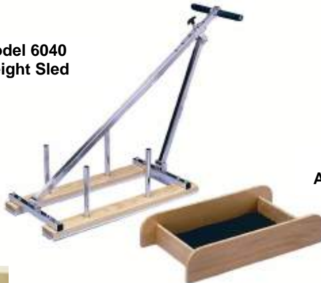
Model 6040 Weight Sled