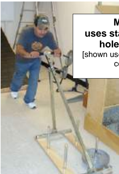
Model 6040 uses standard 1" center hole disk weights [shown used on smooth finished concrete floor]