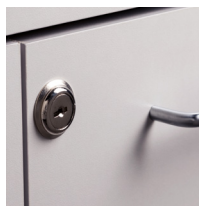
055 Door Locks