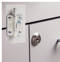
066 Door Locks & Inside Latch