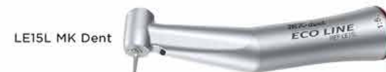
LE15L MK Dent