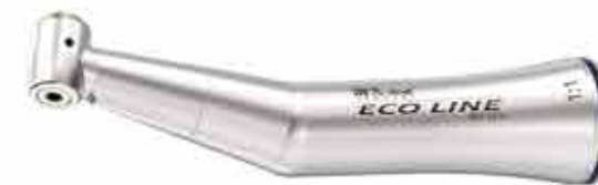
LE11 MK Dent