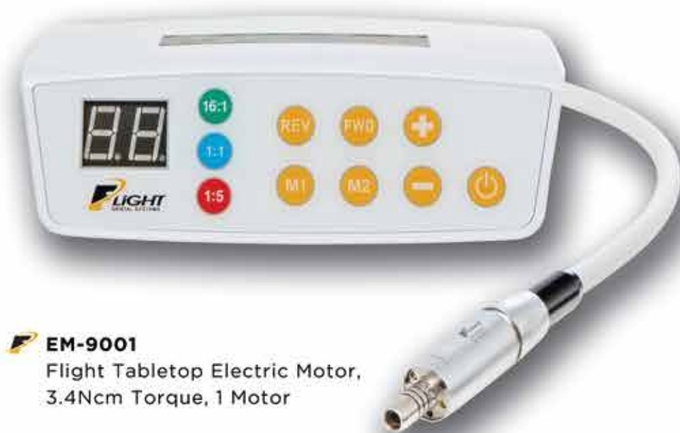
EM-9001 Flight Tabletop Electric Motor, 3.4Ncm Torque, 1 Motor

Flight Electric Motors systems helps to improve efficiency, reduce aerosols while providing a more comfortable patient experience. The Flight Electric system combines the state of the art light weight micromotors with a LED system and quiet and vibration free electric solution.