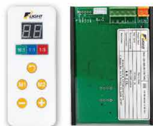
EMB-9002 Flight Built in Electric Motor System, 3.4Ncm Torque, 1 motor