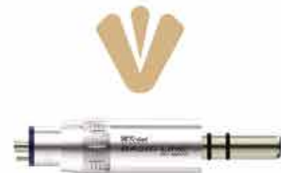
AM0004 MK DENT 20K AIR MOTOR NO WATER