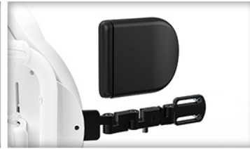
Adjustable Link, Swing Away, Fixed Pad Mount Hardware