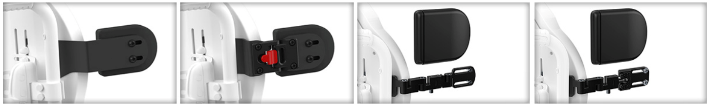
Fixed Modular Mounting Hardware