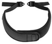
2-Piece Hook & Loop