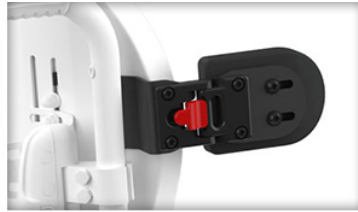
Swing Away Mounting Hardware