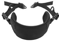
1-Piece with Buckle