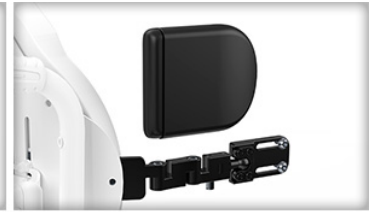
Adjustable Link, Swing Away, Swivel Pad Mount Hardware