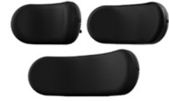
Comfort Soft Adjustable