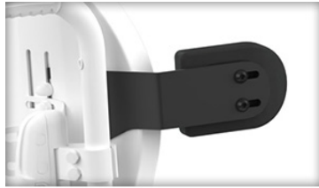
Fixed Modular Mounting Hardware