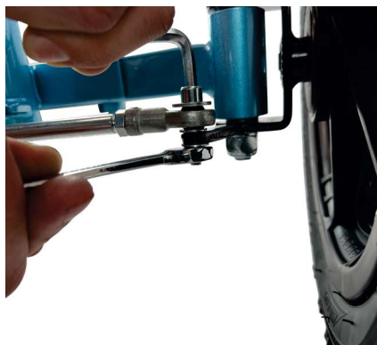
Long Tie Rod assembly