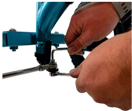
Short Tie Rod assembly

Second, assemble the Long Tie Rod (Top Right). Swing the Tie Rod over to the right spindle. Insert the allen bolt through the 18mm washer and place the allen bolt through the Long Tie Rod. Place a 12mm washer on the bolt and then insert the bolt through the hole of the spindle and then add the Tie Rod locking nut. Tighten both locking nuts, but take care not to over tighten as this could cause some resistance while turning the knee walker. The two bottom photos show the properly assembled Tie Rods.