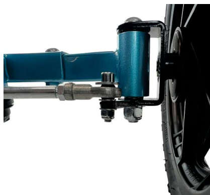
Assembled Long Tie Rod