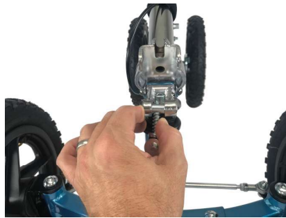
Push pin to the left

Raise the steering column up by pushing the quick release lever to the left allowing the column to raise all the way up (Top Left and Right). Raise the quick release lever upward in to the "U" slot and tighten by turning it clockwise (Bottom Left). Finally, push quick release lever down firmly to secure the steering column (Bottom Right). Reverse these steps when needing to lower steering column for transport.