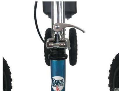
Push lever down firmly