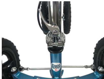
Raise the lever into the "U" shaped slot