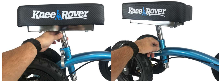
Insert Knee platform into the receptacle tube

The knee platform is designed to be used with either the right or left leg. Insert the knee platform post into the receptacle tube (Top Left). Next, set the knee platform at your desired height for use by inserting the locking pin through the aligned holes (Top Right). We recommend that the knee on the knee platform be at a 90 degree angle while the leg on the ground is straight. Finally, tighten the quick release lever to secure the knee platform in place (Bottom Left).