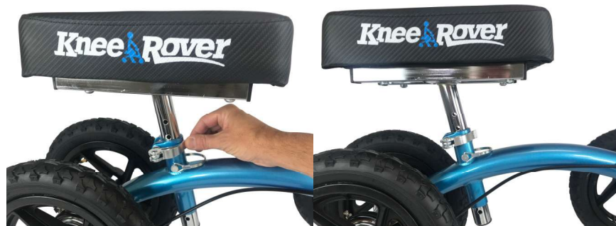
Tighten and secure the quick release lever