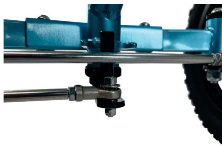
Assembled Short Tie Rod