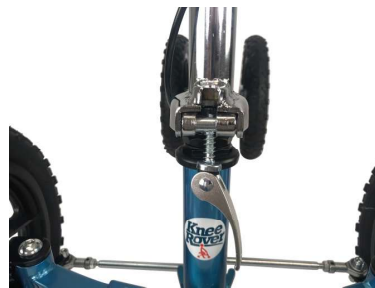
Raise steering column and release the pin