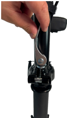
Raise the Quick Release Lever into the "U" shaped slot