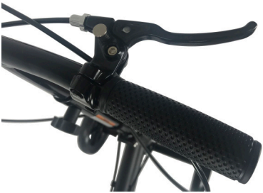
Parking Brake Unlocked