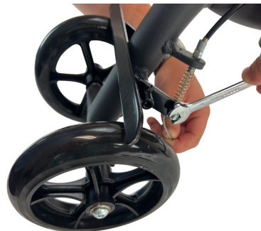
While holding the brake cable, retighten the 10mm nut