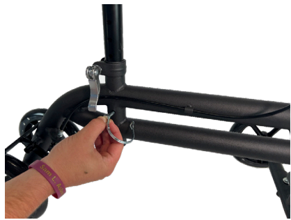
Insert the Locking Pin through the aligned holes