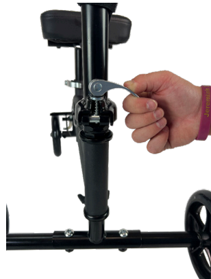
Push the Quick Release Lever down firmly