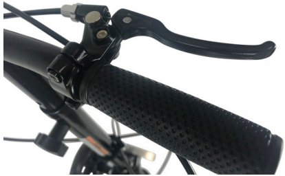
Parking Brake Locked