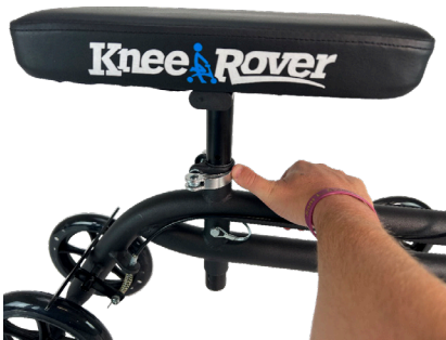
Tighten and secure the Quick Release Lever