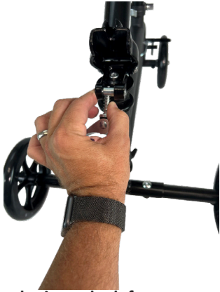
Push pin to the left

Raise the steering column and push the Quick Release Lever to the left to allow security pin to lock into place (Top Left and Right). Raise the Quick Release Lever upward in to the "U" slot and tighten by turning it clockwise (Bottom Left). Finally, push Quick Release Lever down firmly to secure the steering column (Bottom Right). Reverse these steps when needing to lower steering column for transport.