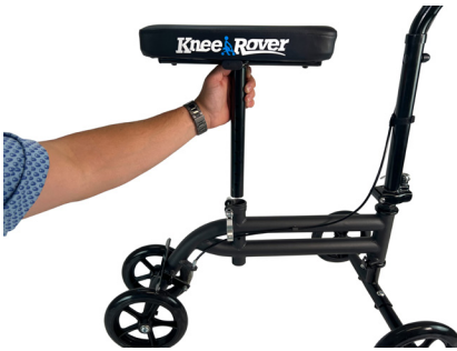
Insert Knee platform into the receptacle tube

The Knee Platform is designed to be used with the right or left leg. Insert the Knee Platform post into the receptacle tube (Top Left). Next, set the Knee Platform at your desired height for use by inserting the Locking Pin through the aligned holes (Top Right). We recommend that the knee on the Knee Platform be at a 90 degree angle while the leg on the ground is straight. Finally, tighten the Quick Release Lever to secure the Knee Platform in place (Bottom Left).