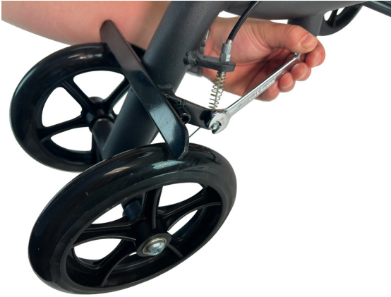
Loosen 10mm nut

You may also view the brake adjustment video by visiting https://kneerover.com/pages/kneerover-maintenance-videos .