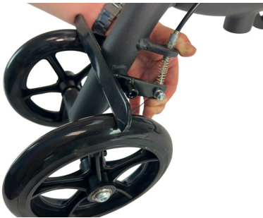
Squeeze spring together and pull the brake cable