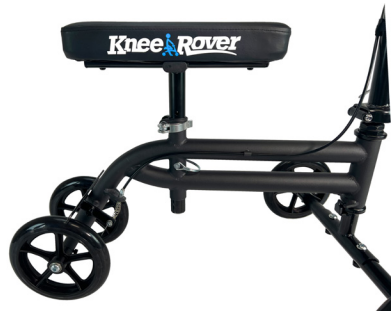
Properly assembled Kneepad