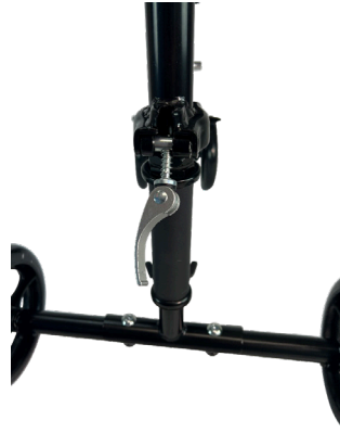
Raise steering column and release the pin