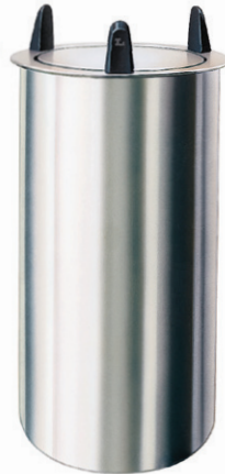
Model 500925 Shielded