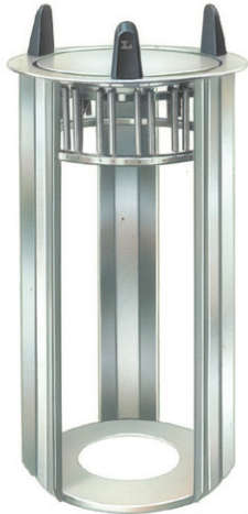
Model 400925 Open

400025, 400525, 400625, 400725, 400825, 400925, 401025 401125, 401225, 500025, 500525, 500625, 500725, 500825 500925, 500925, 501025, 501125, 501225, 600025, 600525 600625, 600725, 600825, 600925, 600925, 601025, 601125 601225