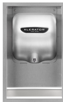
Part # 40505/40502